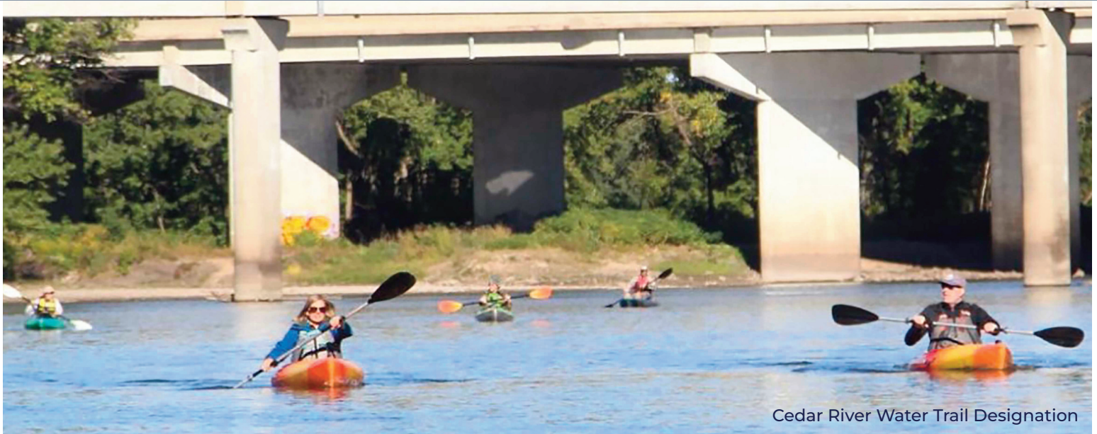
Cedar River Water Trail Designation

Developing Strong Local Government Through Regional Cooperation